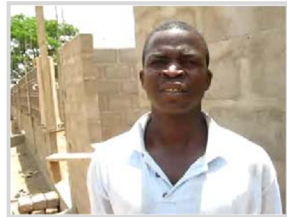
A primary school teacher